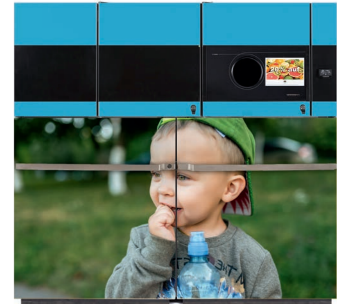
TOMRA T70 TriSort

Digital tools extend your machine capabilities