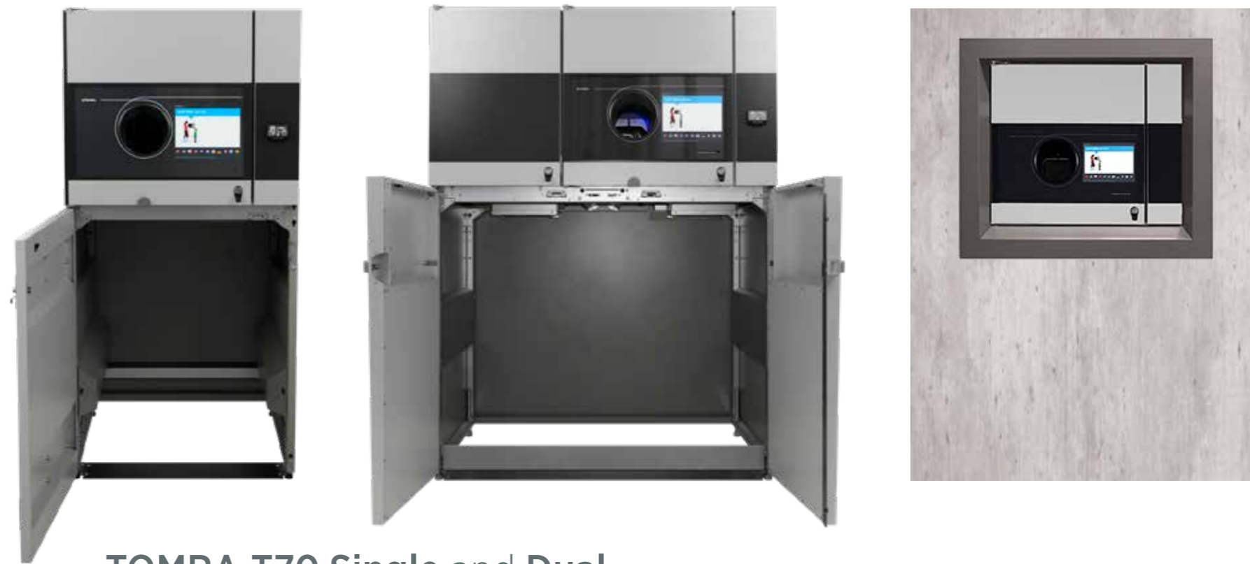
TOMRA T70 Single and Dual

Configure your T70 Single or Dual with front or rear bin access or even install in-wall for a layout solution that works for your customers, your floorplan, and your employees.